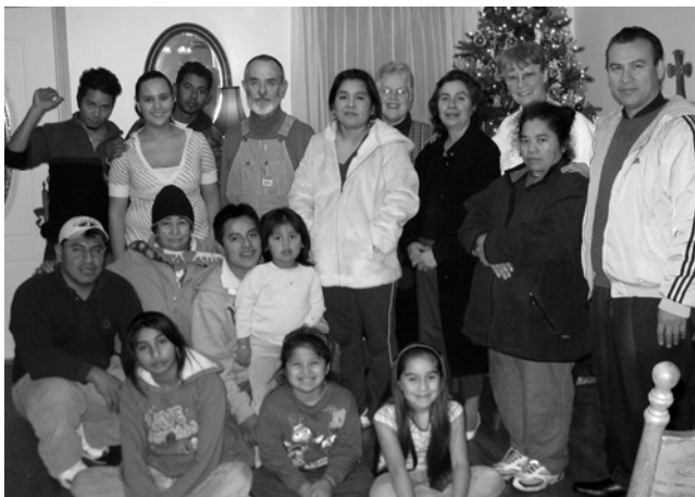
Posadas is a nine day Hispanic celebration in which "the Holy Family" goes to different homes seeking shelter. Our Posadas ran from Dec 16 to 24 and included dozens of parishioners hosting and participating!