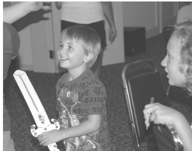
A valiant knight prepares to battle the forces of evil...