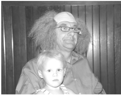
The Professor helps a young Narnian through the wardrobe...