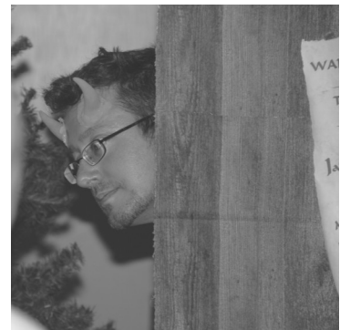
Above: Mr. Tumnus pokes a head out to see what all the commotion is as the Sons of Adam and Daughters of Eve traipse into Narnia... Below: Everyone is always delighted to see Father Christmas, who hasn't appeared in Narnia since the White Witch stole the throne a century ago...