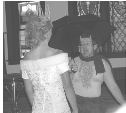
The White Witch freezes a faun with her icy magic...