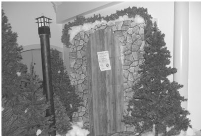
The entrance to Narnia is near the magic lamp post...