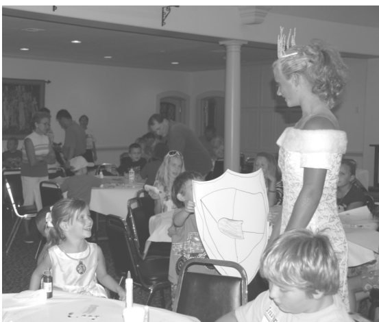
Left: Just because she's beautiful doesn't mean she's good. Jadis, the White Witch, attempts to turn the hearts of the children with promises of sweets and special favors, making them forget their family and their real values...