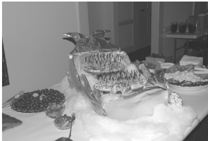
A magic sled filled with Turkish delight is what seduces Edmund into betraying his siblings...